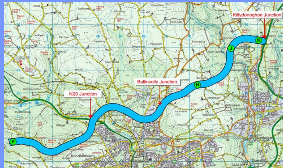
Blue Route Corridor