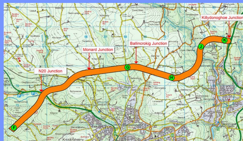
Orange Route Corridor